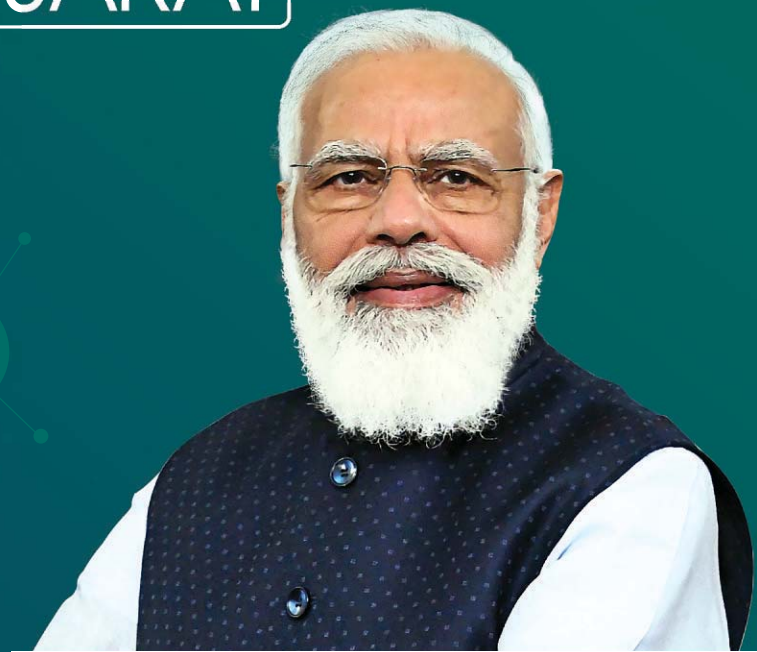
Shri Narendra Modi Hon'ble Prime Minister of India